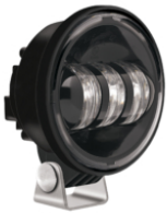
Part Number 0552961 12-110V LED Red Zone Light