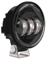
Part Number 0552961 12-110V LED Red Zone Light