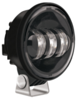
Part Number 0552971 12-110V LED Blue Zone Light