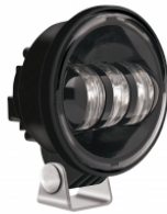
Part Number 0553561 12-110V Antiglare Zone Light