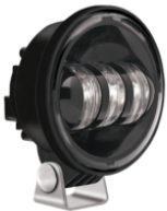
Part Number 0552971 12-110V LED Blue Zone Light