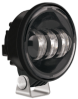
Part Number 0552971 12-110V LED Blue Zone Light