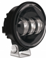
Part Number 0553561 12-110V Antiglare Zone Light