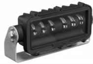
Part Number 0551271 12-24V LED Green Zone Light