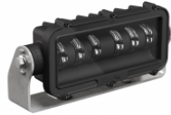
Part Number 0551271 12-24V LED Green Zone Light