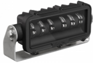
Part Number 0551271 12-24V LED Green Zone Light