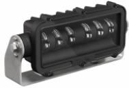
Part Number 0549271 12-24V LED Red Zone Light