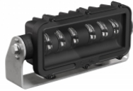
Part Number 0551261 12-24V LED White Zone Light