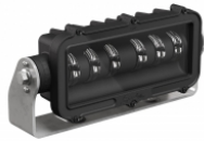
Part Number 0551261 12-24V LED White Zone Light