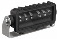
Part Number 0551281 12-24V LED Amber Zone Light