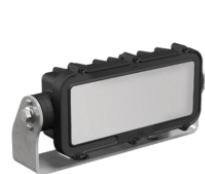
Part Number 0647011 12-24V LED Red & Green Signal Light