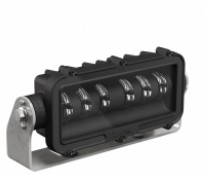
Part Number 0549271 12-24V LED Red Zone Light