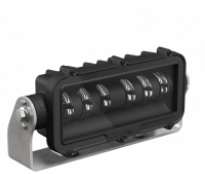
Part Number 0551261 12-24V LED White Zone Light