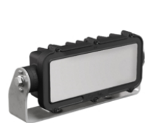
Part Number 0647021 12-24V LED Amber & Green Signal Light