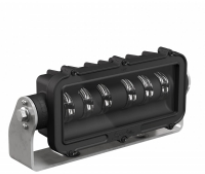
Part Number 0551281 12-24V LED Amber Zone Light