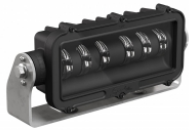
Part Number 0549271 12-24V LED Red Zone Light