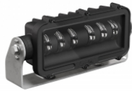
Part Number 0551271 12-24V LED Green Zone Light