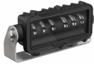
Part Number 0551271 12-24V LED Green Zone Light