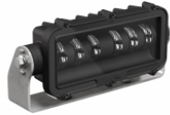
Part Number 0551281 12-24V LED Amber Zone Light