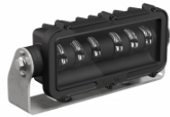
Part Number 0551281 12-24V LED Amber Zone Light