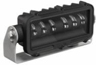
Part Number 0551261 12-24V LED White Zone Light