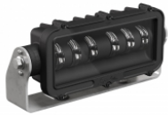
Part Number 0551261 12-24V LED White Zone Light