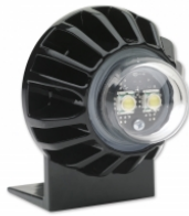
Part Number 0443561 75V LED Engine Compartment Light with Mounting Bracket