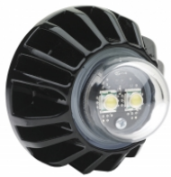
Part Number 0442541 12-24V LED Engine Compartment Light without Mounting Bracket