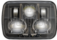
Part Number 0554441 12-24V ECE LED LHT High & Low Beam Heated Headlight with Black Inner Bezel