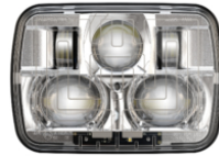
Part Number 0554461 12-24V DOT/ECE LED RHT High & Low Beam Heated Headlight with Chrome Inner Bezel