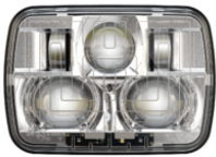
Part Number 0554421 12-24V ECE LED LHT High & Low Beam Heated Headlight with Chrome Inner Bezel