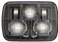
Part Number 0554441 12-24V ECE LED LHT High & Low Beam Heated Headlight with Black Inner Bezel