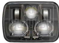
Part Number 0554481 12-24V DOT/ECE LED RHT High & Low Beam Heated Headlight with Black Inner Bezel