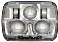
Part Number 0554461 12-24V DOT/ECE LED RHT High & Low Beam Heated Headlight with Chrome Inner Bezel