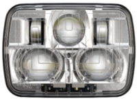
Part Number 0554421 12-24V ECE LED LHT High & Low Beam Heated Headlight with Chrome Inner Bezel