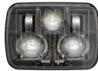
Part Number 0554481 12-24V DOT/ECE LED RHT High & Low Beam Heated Headlight with Black Inner Bezel