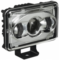
Part Number 0549211 12V DOT/ECE RHT LED Low Beam Headlight