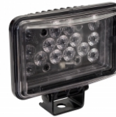
Part Number 1801641 12V LED Work Light with Flood Beam Pattern