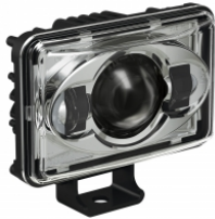
Part Number 0549231 12V DOT/ECE LED High Beam Headlight