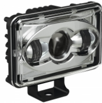
Part Number 0549251 12V ECE LHT LED Low Beam Headlight