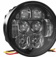
Part Number 0549881 12-24V DOT/ECE LED RHT High & Low Beam Headlight