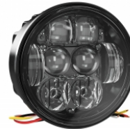
Part Number 0549881 12-24V DOT/ECE LED RHT High & Low Beam Headlight