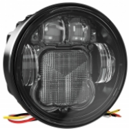
Part Number 0549851 12-24V DOT/ECE LED RHT Low Beam Headlight