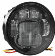
Part Number 0549861 12-24V ECE LED LHT Low Beam Headlight