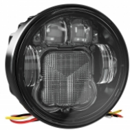
Part Number 0549851 12-24V DOT/ECE LED RHT Low Beam Headlight