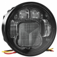
Part Number 0549851 12-24V DOT/ECE LED RHT Low Beam Headlight