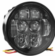
Part Number 0549881 12-24V DOT/ECE LED RHT High & Low Beam Headlight