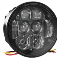
Part Number 0549891 12-24V ECE LED LHT High & Low Beam Headlight