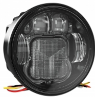
Part Number 0549861 12-24V ECE LED LHT Low Beam Headlight