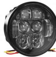
Part Number 0549891 12-24V ECE LED LHT High & Low Beam Headlight