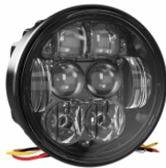
Part Number 0549881 12-24V DOT/ECE LED RHT High & Low Beam Headlight