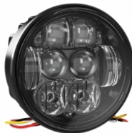
Part Number 0549881 12-24V DOT/ECE LED RHT High & Low Beam Headlight