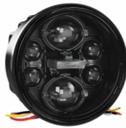
Part Number 0549871 12-24V DOT/ECE LED High Beam Headlight