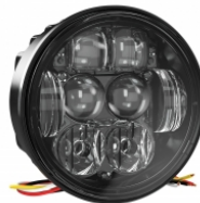
Part Number 0549881 12-24V DOT/ECE LED RHT High & Low Beam Headlight