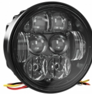
Part Number 0549881 12-24V DOT/ECE LED RHT High & Low Beam Headlight