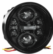
Part Number 0549871 12-24V DOT/ECE LED High Beam Headlight