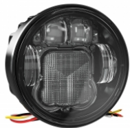
Part Number 0549851 12-24V DOT/ECE LED RHT Low Beam Headlight