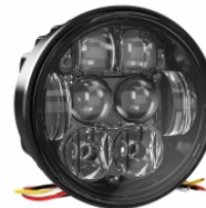
Part Number 0549891 12-24V ECE LED LHT High & Low Beam Headlight