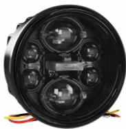
Part Number 0549871 12-24V DOT/ECE LED High Beam Headlight