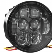
Part Number 0549891 12-24V ECE LED LHT High & Low Beam Headlight