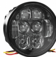
Part Number 0549891 12-24V ECE LED LHT High & Low Beam Headlight