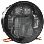
Part Number 0549851 12-24V DOT/ECE LED RHT Low Beam Headlight