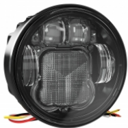
Part Number 0549851 12-24V DOT/ECE LED RHT Low Beam Headlight