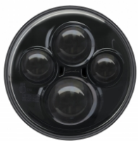
Part Number 0550021 12-24V ECE LED RHT & LHT High Beam with Black Inner Bezel