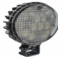
Part Number 1801791 7150F-12/24V Glass Flood