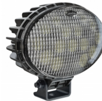
Part Number 1801791 12-24V LED Work Light with Glass Lens & Flood Beam Pattern