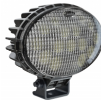
Part Number 1801791 12-24V LED Work Light with Glass Lens & Flood Beam Pattern