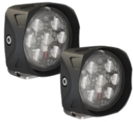
Part Number 0554863 12V LED Work Light Kit with Spot Beam Pattern