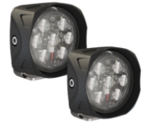
Part Number 0555003 12V LED Work Light Kit with Flood Beam Pattern