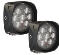
Part Number 0554873 12V LED Work Light Kit with Trapezoid Beam Pattern