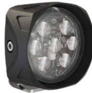
Part Number 0554871 12V LED Work Light with Trapezoid Beam Pattern