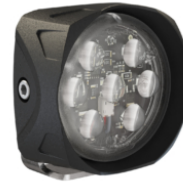
Part Number 0555001 12V LED Work Light with Flood Beam Pattern