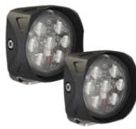
Part Number 0554873 12V LED Work Light Kit with Trapezoid Beam Pattern