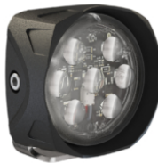
Part Number 0554871 12V LED Work Light with Trapezoid Beam Pattern