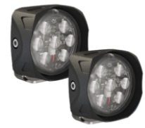
Part Number 0555003 12V LED Work Light Kit with Flood Beam Pattern