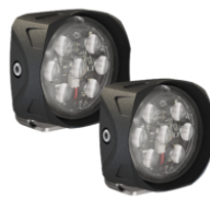
Part Number 0554873 12V LED Work Light Kit with Trapezoid Beam Pattern