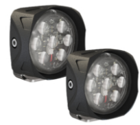
Part Number 0555003 12V LED Work Light Kit with Flood Beam Pattern