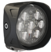
Part Number 0555001 12V LED Work Light with Flood Beam Pattern