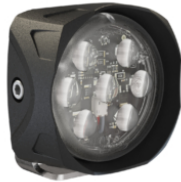
Part Number 0554871 12V LED Work Light with Trapezoid Beam Pattern