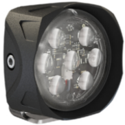
Part Number 0554861 12V LED Work Light with Spot Beam Pattern