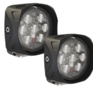
Part Number 0554873 12V LED Work Light Kit with Trapezoid Beam Pattern