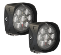
Part Number 0555003 12V LED Work Light Kit with Flood Beam Pattern - Kit of 2