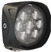
Part Number 0554871 12V LED Work Light with Trapezoid Beam Pattern