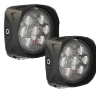
Part Number 0554873 12V LED Work Light Kit with Trapezoid Beam Pattern - Kit of 2