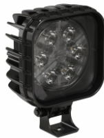
Part Number 1300181 12-24V LED Auxiliary Light with Flood Beam Pattern