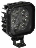
Part Number 1300161 12-24V LED Auxiliary Light with Spot Beam Pattern