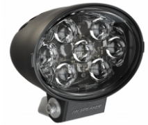
Part Number 0550711 12-24V LED Auxiliary Light with Pencil Beam Auxiliary Light - 1 Light Kit