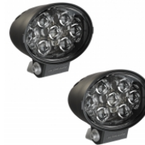
Part Number 0550693 12-24V ECE LED Auxiliary Light with Driving Beam - 2 Light Kit