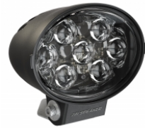
Part Number 0550711 12-24V LED Auxiliary Light with Pencil Beam Auxiliary Light - 1 Light Kit