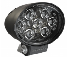
Part Number 0550711 12-24V LED Auxiliary Light with Pencil Beam Auxiliary Light - 1 Light Kit