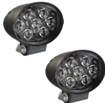
Part Number 0550673 12-24V DOT LED Auxiliary Light with Driving Beam - 2 Light Kit