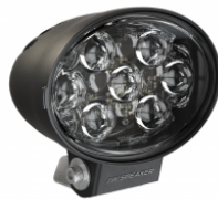
Part Number 0550691 12-24V ECE LED Auxiliary Light with Driving Beam - 1 Light