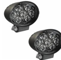
Part Number 0550693 12-24V ECE LED Auxiliary Light with Driving Beam - 2 Light Kit