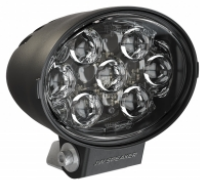
Part Number 0550671 12-24V DOT LED Auxiliary Light with Driving Beam - 1 Light