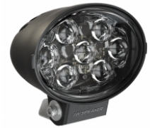
Part Number 0550711 12-24V LED Auxiliary Light with Pencil Beam Auxiliary Light - 1 Light Kit