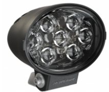
Part Number 0550711 12-24V LED Auxiliary Light with Pencil Beam Auxiliary Light - 1 Light Kit