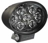
Part Number 0550671 12-24V DOT LED Auxiliary Light with Driving Beam - 1 Light