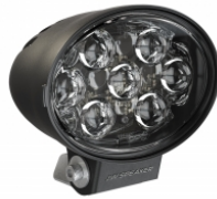
Part Number 0550691 12-24V ECE LED Auxiliary Light with Driving Beam - 1 Light