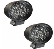
Part Number 0550713 12-24V LED Auxiliary Light with Pencil Beam - 2 Light Kit