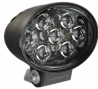
Part Number 0550691 12-24V ECE LED Auxiliary Light with Driving Beam - 1 Light