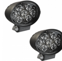
Part Number 0550713 12-24V LED Auxiliary Light with Pencil Beam - 2 Light Kit