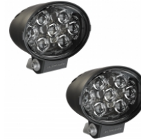
Part Number 0550693 12-24V ECE LED Auxiliary Light with Driving Beam - 2 Light Kit