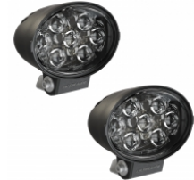
Part Number 0550713 12-24V LED Auxiliary Light with Pencil Beam - 2 Light Kit