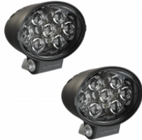
Part Number 0550673 12-24V DOT LED Auxiliary Light with Driving Beam - 2 Light Kit