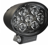
Part Number 0550711 12-24V LED Auxiliary Light with Pencil Beam Auxiliary Light - 1 Light