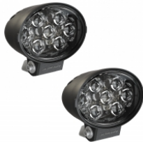
Part Number 0550673 12-24V DOT LED Auxiliary Light with Driving Beam - 2 Light Kit