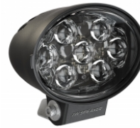
Part Number 0550711 12-24V LED Auxiliary Light with Pencil Beam Auxiliary Light - 1 Light