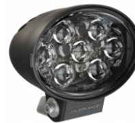
Part Number 0550711 12-24V LED Auxiliary Light with Pencil Beam Auxiliary Light - 1 Light