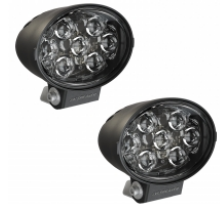
Part Number 0550713 12-24V LED Auxiliary Light with Pencil Beam - 2 Light Kit