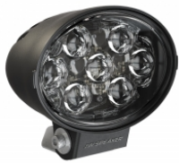
Part Number 0550671 12-24V DOT LED Auxiliary Light with Driving Beam - 1 Light