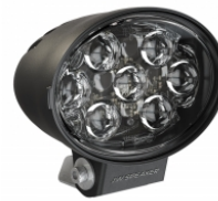
Part Number 0550711 12-24V LED Auxiliary Light with Pencil Beam Auxiliary Light - 1 Light