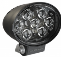
Part Number 0550691 12-24V ECE LED Auxiliary Light with Driving Beam - 1 Light