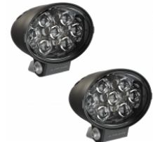
Part Number 0550713 12-24V LED Auxiliary Light with Pencil Beam - 2 Light Kit