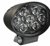
Part Number 0550711 12-24V LED Auxiliary Light with Pencil Beam Auxiliary Light - 1 Light