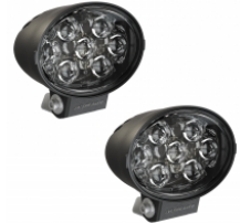
Part Number 0550713 12-24V LED Auxiliary Light with Pencil Beam - 2 Light Kit