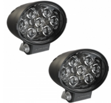
Part Number 0550713 12-24V LED Auxiliary Light with Pencil Beam - 2 Light Kit