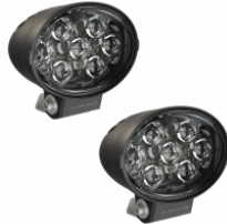
Part Number 0550693 12-24V ECE LED Auxiliary Light with Driving Beam - 2 Light Kit