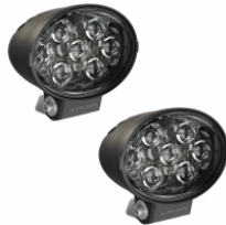
Part Number 0550693 12-24V ECE LED Auxiliary Light with Driving Beam - 2 Light Kit