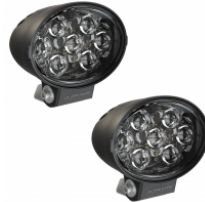
Part Number 0550693 12-24V ECE LED Auxiliary Light with Driving Beam - 2 Light Kit