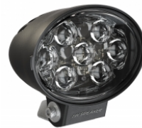
Part Number 0550711 12-24V LED Auxiliary Light with Pencil Beam Auxiliary Light - 1 Light