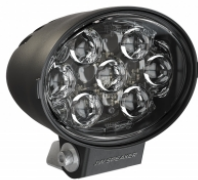
Part Number 0550691 12-24V ECE LED Auxiliary Light with Driving Beam - 1 Light