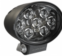
Part Number 0550711 12-24V LED Auxiliary Light with Pencil Beam Auxiliary Light - 1 Light