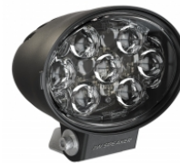
Part Number 0550711 12-24V LED Auxiliary Light with Pencil Beam Auxiliary Light - 1 Light