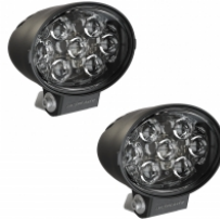
Part Number 0550693 12-24V ECE LED Auxiliary Light with Driving Beam - 2 Light Kit