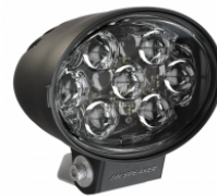
Part Number 0550711 12-24V LED Auxiliary Light with Pencil Beam Auxiliary Light - 1 Light