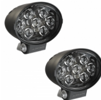
Part Number 0550693 12-24V ECE LED Auxiliary Light with Driving Beam - 2 Light Kit