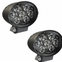
Part Number 0550693 12-24V ECE LED Auxiliary Light with Driving Beam - 2 Light Kit