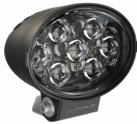
Part Number 0550691 12-24V ECE LED Auxiliary Light with Driving Beam - 1 Light