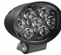
Part Number 0550711 12-24V LED Auxiliary Light with Pencil Beam Auxiliary Light - 1 Light