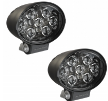
Part Number 0550713 12-24V LED Auxiliary Light with Pencil Beam - 2 Light Kit