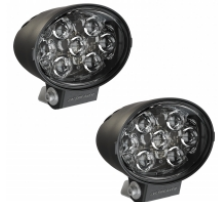
Part Number 0550713 12-24V LED Auxiliary Light with Pencil Beam - 2 Light Kit