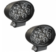
Part Number 0550713 12-24V LED Auxiliary Light with Pencil Beam - 2 Light Kit