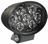
Part Number 0550671 12-24V DOT LED Auxiliary Light with Driving Beam - 1 Light