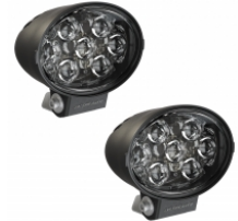
Part Number 0550713 12-24V LED Auxiliary Light with Pencil Beam - 2 Light Kit