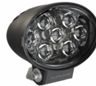
Part Number 0550711 12-24V LED Auxiliary Light with Pencil Beam Auxiliary Light - 1 Light Kit