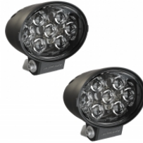
Part Number 0550693 12-24V ECE LED Auxiliary Light with Driving Beam - 2 Light Kit