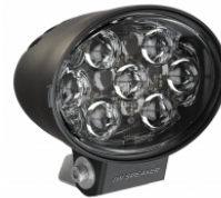
Part Number 0550711 12-24V LED Auxiliary Light with Pencil Beam Auxiliary Light - 1 Light Kit