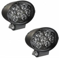
Part Number 0550673 12-24V DOT LED Auxiliary Light with Driving Beam - 2 Light Kit