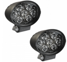
Part Number 0550713 12-24V LED Auxiliary Light with Pencil Beam - 2 Light Kit