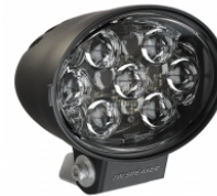
Part Number 0550711 12-24V LED Auxiliary Light with Pencil Beam Auxiliary Light - 1 Light Kit