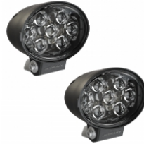
Part Number 0550693 12-24V ECE LED Auxiliary Light with Driving Beam - 2 Light Kit