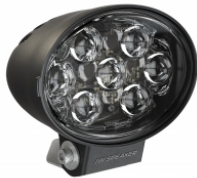
Part Number 0550691 12-24V ECE LED Auxiliary Light with Driving Beam - 1 Light Kit