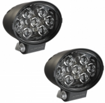
Part Number 0550673 12-24V DOT LED Auxiliary Light with Driving Beam - 2 Light Kit