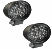
Part Number 0550713 12-24V LED Auxiliary Light with Pencil Beam - 2 Light Kit