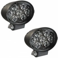
Part Number 0550673 12-24V DOT LED Auxiliary Light with Driving Beam - 2 Light Kit