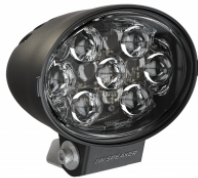
Part Number 0550691 12-24V ECE LED Auxiliary Light with Driving Beam - 1 Light Kit