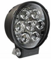
Part Number 0550481 12-24V LED Auxiliary Light with Pencil Beam - 1 Light