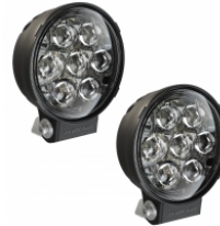
Part Number 0550463 12-24V ECE LED Auxiliary Light with Driving Beam - 2 Light Kit