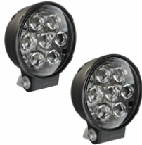
Part Number 0550443 12-24V DOT LED Auxiliary Light with Driving Beam - 2 Light Kit