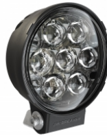
Part Number 0550461 12-24V ECE LED Auxiliary Light with Driving Beam - 1 Light