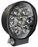
Part Number 0550441 12-24V DOT LED Auxiliary Light with Driving Beam - 1 Light