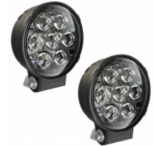
Part Number 0550483 12-24V LED Auxiliary Light with Pencil Beam - 2 Light Kit