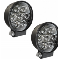
Part Number 0550463 12-24V ECE LED Auxiliary Light with Driving Beam - 2 Light Kit