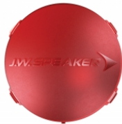
Part Number 5874291 Red Replacement Lens Cover for Model TS3001R