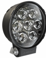
Part Number 0550461 12-24V ECE LED Auxiliary Light with Driving Beam - 1 Light