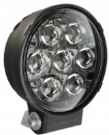
Part Number 0550441 12-24V DOT LED Auxiliary Light with Driving Beam - 1 Light