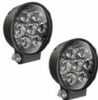
Part Number 0550443 12-24V DOT LED Auxiliary Light with Driving Beam - 2 Light Kit