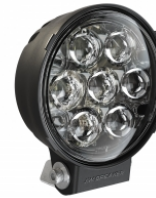
Part Number 0550481 12-24V LED Auxiliary Light with Pencil Beam - 1 Light