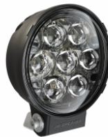
Part Number 0550461 12-24V ECE LED Auxiliary Light with Driving Beam - 1 Light