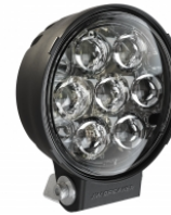
Part Number 0550481 12-24V LED Auxiliary Light with Pencil Beam - 1 Light