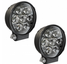
Part Number 0550483 12-24V LED Auxiliary Light with Pencil Beam - 2 Light Kit