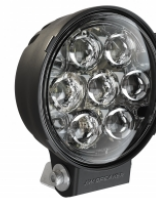
Part Number 0550481 12-24V LED Auxiliary Light with Pencil Beam - 1 Light