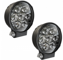
Part Number 0550483 12-24V LED Auxiliary Light with Pencil Beam - 2 Light Kit