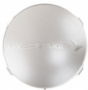
Part Number 5874271 Clear Replacement Lens Cover for Model TS3001R