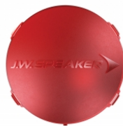
Part Number 5874291 Red Replacement Lens Cover for Model TS3001R