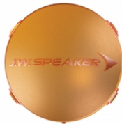
Part Number 5874281 Amber Replacement Lens Cover for Model TS3001R