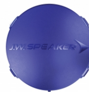
Part Number 5874301 Blue Replacement Lens Cover for Model TS3001R