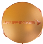
Part Number 5874281 Amber Replacement Lens Cover for Model TS3001R