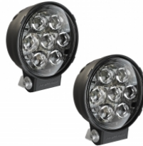
Part Number 0550463 12-24V ECE LED Auxiliary Light with Driving Beam - 2 Light Kit