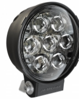
Part Number 0550481 12-24V LED Auxiliary Light with Pencil Beam - 1 Light