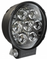
Part Number 0550461 12-24V ECE LED Auxiliary Light with Driving Beam - 1 Light