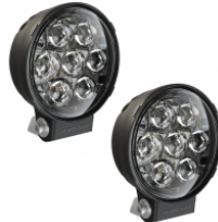
Part Number 0550463 12-24V ECE LED Auxiliary Light with Driving Beam - 2 Light Kit