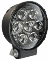
Part Number 0550461 12-24V ECE LED Auxiliary Light with Driving Beam - 1 Light