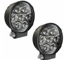
Part Number 0550483 12-24V LED Auxiliary Light with Pencil Beam - 2 Light Kit