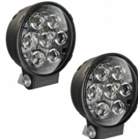
Part Number 0550463 12-24V ECE LED Auxiliary Light with Driving Beam - 2 Light Kit