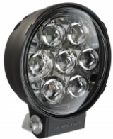
Part Number 0550441 12-24V DOT LED Auxiliary Light with Driving Beam - 1 Light