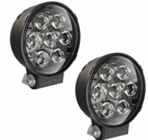
Part Number 0550483 12-24V LED Auxiliary Light with Pencil Beam - 2 Light Kit