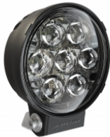
Part Number 0550461 12-24V ECE LED Auxiliary Light with Driving Beam - 1 Light Kit