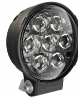
Part Number 0550481 12-24V LED Auxiliary Light with Pencil Beam - 1 Light