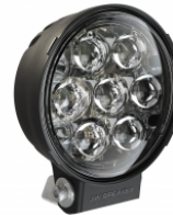
Part Number 0550481 12-24V LED Auxiliary Light with Pencil Beam - 1 Light