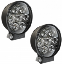
Part Number 0550443 12-24V DOT LED Auxiliary Light with Driving Beam - 2 Light Kit