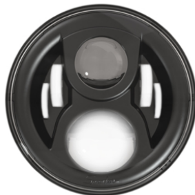
STANDARD HIGH BEAM