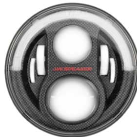
DUAL BURN™ HIGH BEAM