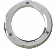
Part Number 8200451 4" Round Chrome Plastic Trim Ring for Model 234