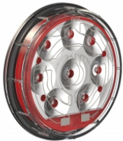
Part Number 0346261 12-24V DOT LED Heated Stop & Tail Light