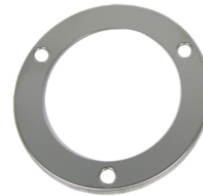
Part Number 8200441 4" Round Stainless Steel Trim Ring for Model 234