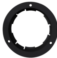
Part Number 5869401 4" Round Plastic Mounting Flange for Model 234