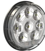
Part Number 0346471 12-24V DOT LED Heated Reverse Light