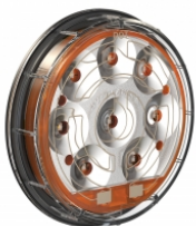
Part Number 0347811 12-24V DOT LED Heated Turn Signal