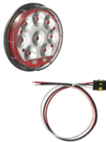
Part Number 0346264 12-24V DOT LED Heated Stop & Tail Light Kit with Harness