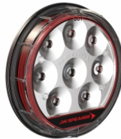
Part Number 0346421 12-48V DOT LED Non- Heated Stop & Tail Light