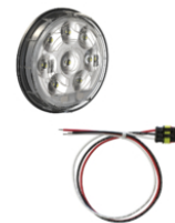
Part Number 0346474 12-24V DOT LED Heated Reverse Light Kit with Harness