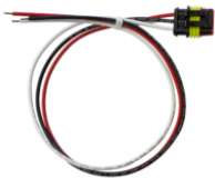
Part Number 3270501 3-Pin AMP Connector (#282087-1) Wire Harness Assembly