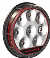
Part Number 0347861 12-24V DOT LED Non- Heated Stop & Tail Light