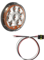
Part Number 0347814 12-24V DOT LED Heated Turn Signal Kit with Harness