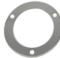
Part Number 8200441 4" Round Stainless Steel Trim Ring for Model 234