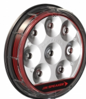
Part Number 0347861 12-24V DOT LED Non- Heated Stop & Tail Light