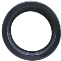
Part Number 4242731 4" Round Rubber Mounting Grommet for Model 234