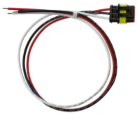
Part Number 3270501 3-Pin AMP Connector (#282087-1) Wire Harness Assembly