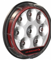
Part Number 0347861 12-24V DOT LED Non- Heated Stop & Tail Light