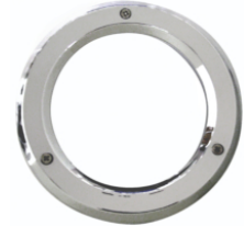
Part Number 8200451 4" Round Chrome Plastic Trim Ring for Model 234