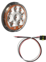
Part Number 0347814 12-24V DOT LED Heated Amber Turn Signal Kit with Harness