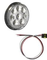
Part Number 0346474 12-24V DOT LED Heated White Reverse Light Kit with Harness