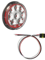
Part Number 0346264 12-24V DOT LED Heated Red Stop, Tail, & Turn Light Kit with Harness