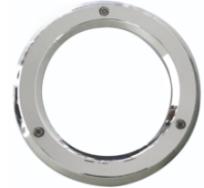
Part Number 8200451 4" Round Chrome Plastic Trim Ring for Model 234