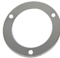
Part Number 8200441 4" Round Stainless Steel Trim Ring for Model 234