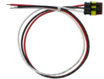
Part Number 3270501 3-Pin AMP Connector (#282087-1) Wire Harness Assembly