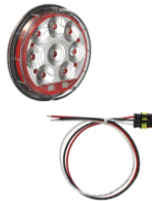
Part Number 0346264 12-24V DOT LED Heated Stop & Tail Light Kit with Harness