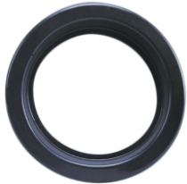
Part Number 4242731 4" Round Rubber Mounting Grommet for Model 234