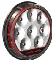
Part Number 0347861 12-24V DOT LED Non- Heated Stop & Tail Light