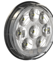
Part Number 0346471 12-24V DOT LED Heated Reverse Light