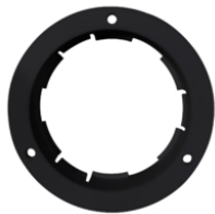
Part Number 5869401 4" Round Plastic Mounting Flange for Model 234