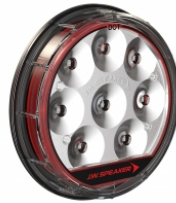
Part Number 0346421 12-48V DOT LED Non- Heated Stop & Tail Light