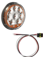
Part Number 0347814 12-24V DOT LED Heated Turn Signal Kit with Harness