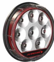
Part Number 0347861 12-24V DOT LED Non- Heated Stop, Tail, & Turn Light