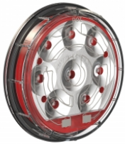
Part Number 0346261 12-24V DOT LED Heated Red Stop, Tail, & Turn Light