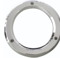
Part Number 8200451 4" Round Chrome Plastic Trim Ring for Model 234