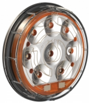
Part Number 0347811 12-24V DOT LED Heated Turn Signal