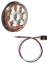
Part Number 0347814 12-24V DOT LED Heated Turn Signal Kit with Harness