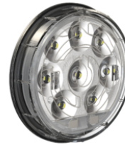
Part Number 0346471 12-24V DOT LED Heated White Reverse Light