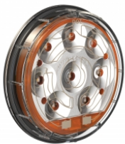
Part Number 0347811 12-24V DOT LED Heated Amber Turn Signal