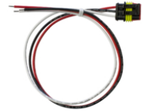
Part Number 3270501 3-Pin AMP Connector Wire Harness Assembly