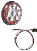
Part Number 0346264 12-24V DOT LED Heated Stop & Tail Light Kit with Harness