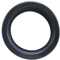
Part Number 4242731 4" Round Rubber Mounting Grommet for Model 234