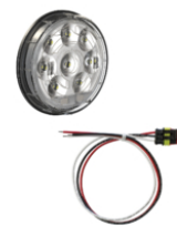
Part Number 0346474 12-24V DOT LED Heated White Reverse Light Kit with Harness