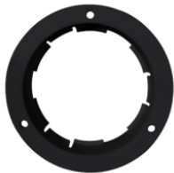
Part Number 5869401 4" Round Plastic Mounting Flange for Model 234