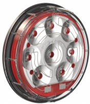
Part Number 0346261 12-24V DOT LED Heated Red Stop, Tail, & Turn Light