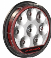
Part Number 0346421 12-48V DOT LED Non-Heated Stop & Tail Light