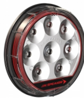
Part Number 0347861 12-24V DOT LED Non- Heated Red Stop, Tail, & Turn Light