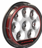
Part Number 0347861 12-24V DOT LED Non-Heated Stop, Tail, & Turn Light