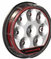
Part Number 0346421 12-48V DOT LED Non- Heated Stop & Tail Light