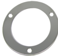
Part Number 8200441 4" Round Stainless Steel Trim Ring for Model 234