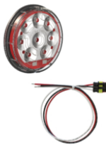
Part Number 0346264 12-24V DOT LED Heated Red Stop, Tail, & Turn Light Kit with Harness