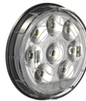
Part Number 0346471 12-24V DOT LED Heated White Reverse Light