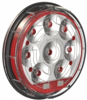
Part Number 0346261 12-24V DOT LED Heated Red Stop, Tail, & Turn Light