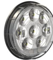
Part Number 0346471 12-24V DOT LED Heated White Reverse Light