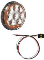
Part Number 0347814 12-24V DOT LED Heated Turn Signal Kit with Harness