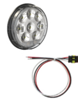
Part Number 0346474 12-24V DOT LED Heated Reverse Light Kit with Harness