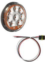
Part Number 0347814 12-24V DOT LED Heated Amber Turn Signal Kit with Harness