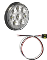
Part Number 0346474 12-24V DOT LED Heated White Reverse Light Kit with Harness