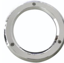
Part Number 8200451 4" Round Chrome Plastic Trim Ring for Model 234