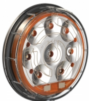
Part Number 0347811 12-24V DOT LED Heated Amber Turn Signal