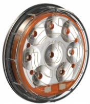
Part Number 0347811 12-24V DOT LED Heated Amber Turn Signal