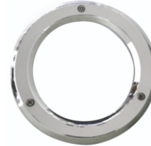
Part Number 8200451 4" Round Chrome Plastic Trim Ring for Model 234