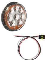
Part Number 0347814 12-24V DOT LED Heated Amber Turn Signal Kit with Harness