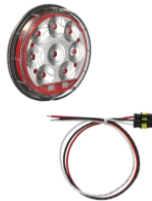
Part Number 0346264 12-24V DOT LED Heated Red Stop, Tail, & Turn Light Kit with Harness