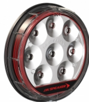
Part Number 0347861 12-24V DOT LED Non- Heated Stop & Tail Light