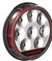
Part Number 0347861 12-24V DOT LED Non- Heated Stop & Tail Light