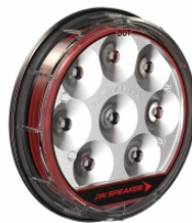
Part Number 0347861 12-24V DOT LED Non-Heated Stop, Tail, & Turn Light