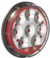
Part Number 0346261 12-24V DOT LED Heated Red Stop, Tail, & Turn Light