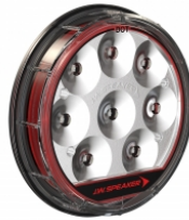
Part Number 0346421 12-48V DOT LED Non- Heated Stop & Tail Light