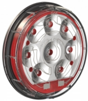
Part Number 0346261 12-24V DOT LED Heated Stop & Tail Light