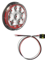
Part Number 0346264 12-24V DOT LED Heated Red Stop, Tail, & Turn Light Kit with Harness