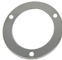
Part Number 8200441 4" Round Stainless Steel Trim Ring for Model 234