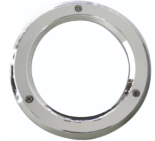
Part Number 8200451 4" Round Chrome Plastic Trim Ring for Model 234