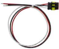
Part Number 3270501 3-Pin AMP Connector (#282087-1) Wire Harness Assembly