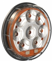
Part Number 0347811 12-24V DOT LED Heated Turn Signal