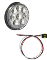
Part Number 0346474 12-24V DOT LED Heated Reverse Light Kit with Harness