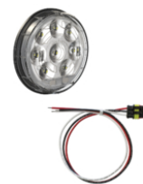
Part Number 0346474 12-24V DOT LED Heated White Reverse Light Kit with Harness