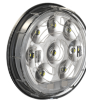
Part Number 0346471 12-24V DOT LED Heated White Reverse Light