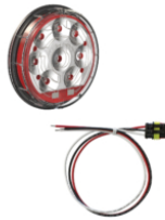
Part Number 0346264 12-24V DOT LED Heated Stop & Tail Light Kit with Harness