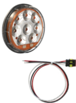
Part Number 0347814 12-24V DOT LED Heated Turn Signal Kit with Harness