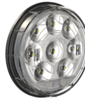
Part Number 0346471 12-24V DOT LED Heated Reverse Light