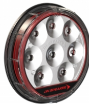
Part Number 0346421 12-48V DOT LED Non-Heated Stop & Tail Light