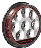
Part Number 0347861 12-24V DOT LED Non- Heated Stop & Tail Light