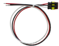
Part Number 3270501 3-Pin AMP Connector (#282087-1) Wire Harness Assembly