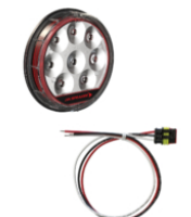
Part Number 0347864 12-24V DOT LED Non- Heated Stop, Tail, & Turn Light Kit with Harness