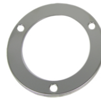
Part Number 8200441 4" Round Stainless Steel Trim Ring for Model 234