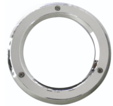
Part Number 8200451 4" Round Chrome Plastic Trim Ring for Model 234