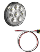
Part Number 0346474 12-24V DOT LED Heated White Reverse Light Kit with Harness