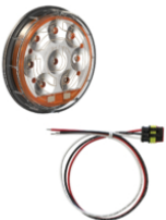
Part Number 0347814 12-24V DOT LED Heated Turn Signal Kit with Harness