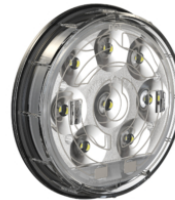
Part Number 0346471 12-24V DOT LED Heated Reverse Light