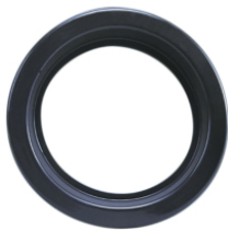
Part Number 4242731 4" Round Rubber Mounting Grommet for Model 234