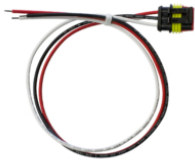
Part Number 3270501 3-Pin AMP Connector (#282087-1) Wire Harness Assembly