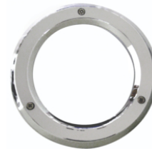
Part Number 8200451 4" Round Chrome Plastic Trim Ring for Model 234