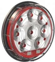
Part Number 0346261 12-24V DOT LED Heated Stop & Tail Light