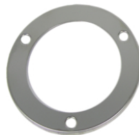
Part Number 8200441 4" Round Stainless Steel Trim Ring for Model 234