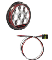
Part Number 0347864 12-24V DOT LED Non- Heated Stop & Tail Light Kit with Harness