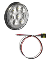
Part Number 0346474 12-24V DOT LED Heated Reverse Light Kit with Harness