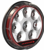
Part Number 0346421 12-48V DOT LED Non- Heated Stop & Tail Light