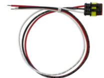
Part Number 3270501 3-Pin AMP Connector (#282087-1) Wire Harness Assembly