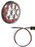
Part Number 0346264 12-24V DOT LED Heated Stop & Tail Light Kit with Harness