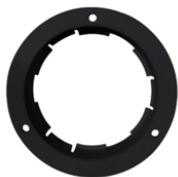
Part Number 5869401 4" Round Plastic Mounting Flange for Model 234