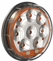
Part Number 0347811 12-24V DOT LED Heated Turn Signal