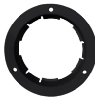
Part Number 5869401 4" Round Plastic Mounting Flange for Model 234