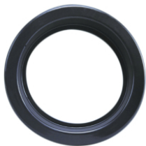
Part Number 4242731 4" Round Rubber Mounting Grommet for Model 234