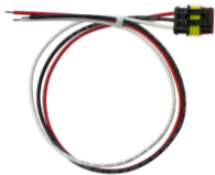
Part Number 3270501 3-Pin AMP Connector (#282087-1) Wire Harness Assembly