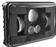
Part Number 0552561 12-24V ECE LED LHT Low Beam Headlight with Black Bezel