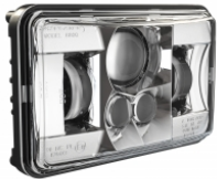
Part Number 0551371 12-24V DOT/ECE LED RHT Low Beam Headlight with Chrome Bezel