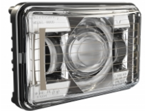
Part Number 0551781 12-24V DOT/ECE LED High Beam Heated Headlight with Chrome Bezel