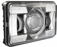
Part Number 0551381 12-24V DOT/ECE LED High Beam Headlight with Chrome Bezel