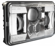
Part Number 0551391 12-24V ECE LED LHT Low Beam Headlight with Chrome Bezel