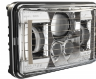
Part Number 0551771 12-24V DOT/ECE LED RHT Low Beam Heated Headlight with Chrome Bezel