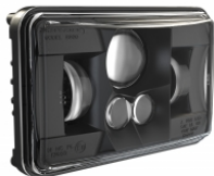
Part Number 0552551 12-24V DOT/ECE LED RHT Low Beam Headlight with Black Bezel