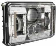
Part Number 0552091 12-24V ECE LED LHT Low Beam Heated Headlight with Chrome Bezel