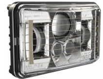
Part Number 0552091 12-24V ECE LED LHT Low Beam Heated Headlight with Chrome Bezel