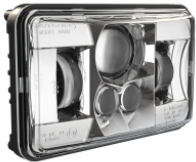
Part Number 0551371 12-24V DOT/ECE LED RHT Low Beam Headlight with Chrome Bezel