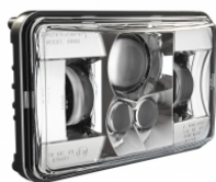
Part Number 0551371 12-24V DOT/ECE LED RHT Low Beam Headlight with Chrome Bezel