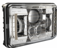
Part Number 0551771 12-24V DOT/ECE LED RHT Low Beam Heated Headlight with Chrome Bezel