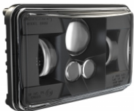
Part Number 0552551 12-24V DOT/ECE LED RHT Low Beam Headlight with Black Bezel