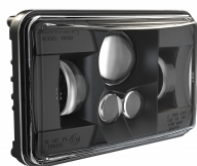
Part Number 0552551 12-24V DOT/ECE LED RHT Low Beam Headlight with Black Bezel