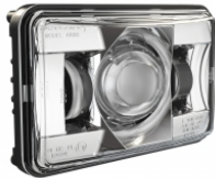
Part Number 0551381 12-24V DOT/ECE LED High Beam Headlight with Chrome Bezel