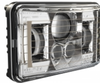
Part Number 0551771 12-24V DOT/ECE LED RHT Low Beam Heated Headlight with Chrome Bezel