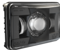
Part Number 0552571 12-24V DOT/ECE LED High Beam Headlight with Black Bezel