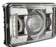
Part Number 0551781 12-24V DOT/ECE LED High Beam Heated Headlight with Chrome Bezel