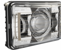
Part Number 0551781 12-24V DOT/ECE LED High Beam Heated Headlight with Chrome Bezel