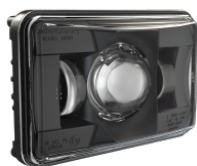
Part Number 0552571 12-24V DOT/ECE LED High Beam Headlight with Black Bezel