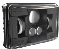
Part Number 0552561 12-24V ECE LED LHT Low Beam Headlight with Black Bezel