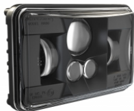
Part Number 0552561 12-24V ECE LED LHT Low Beam Headlight with Black Bezel