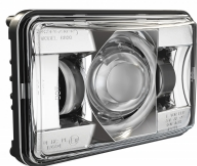
Part Number 0551381 12-24V DOT/ECE LED High Beam Headlight with Chrome Bezel