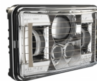
Part Number 0552091 12-24V ECE LED LHT Low Beam Heated Headlight with Chrome Bezel