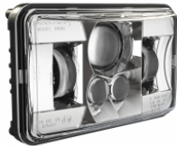
Part Number 0551391 12-24V ECE LED LHT Low Beam Headlight with Chrome Bezel