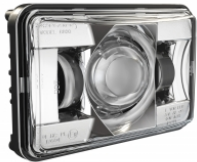
Part Number 0551381 12-24V DOT/ECE LED High Beam Headlight with Chrome Bezel