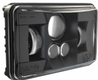
Part Number 0552551 12-24V DOT/ECE LED RHT Low Beam Headlight with Black Bezel