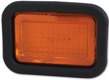
Model 240 Low Profile Strobe Light (Front View)