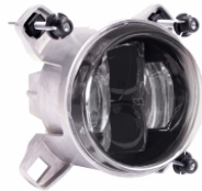
Part Number 0551221 12-24V DOT/ECE LED Symmetrical Low Beam Headlight