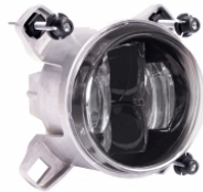
Part Number 0551221 12-24V DOT/ECE Reg 113 LED Symmetrical Low Beam Headlight