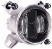
Part Number 0551211 12-24V DOT/ECE LED RHT Low Beam Headlight