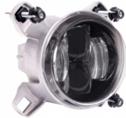
Part Number 0551221 12-24V DOT/ECE Reg 113 LED Symmetrical Low Beam Headlight