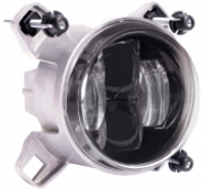
Part Number 0551201 12-24V ECE LED LHT Low Beam Headlight