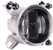
Part Number 0551221 12-24V DOT/ECE LED Symmetrical Low Beam Headlight