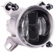
Part Number 0551201 12-24V ECE LED LHT Low Beam Headlight