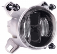
Part Number 0551211 12-24V DOT/ECE LED RHT Low Beam Headlight