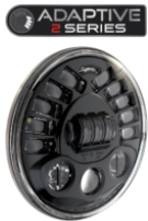
7" Round Headlights

Adaptive LED Headlights - Model 8790 Adaptive 2