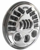
7" Round Headlights