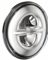
7" Round Headlights