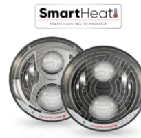
7" Round Headlights with Dual Burn™ Technology

LED Headlights - Model 8700 Evo 2 Dual Burn