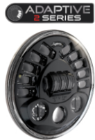
7" Round Headlights

Adaptive LED Headlights - Model 8790 Adaptive 2