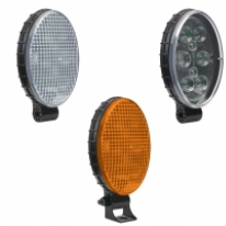
3" x 5" Round LED Work Lamps