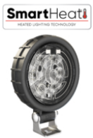
4.5" Round Heated & Non-Heated Work Lamps