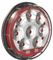
4" Heated & Non-Heated Tail Lights LED Tail Lights - Model 234