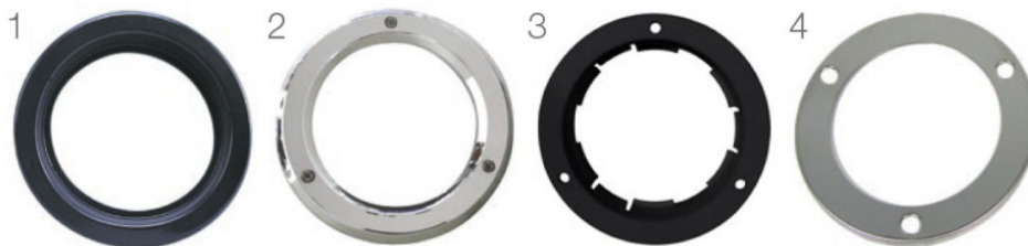
Part No. 3270501